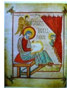
Lindisfarne Gospel, St. Matthew